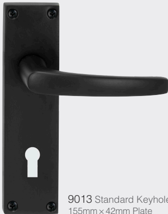
9013 Standard Keyhole 155mm x 42mm Plate