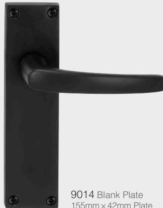
9014 Blank Plate 155mm x 42mm Plate