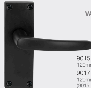
9015 Lever Set (Pic) 120mm x 42mm plate 9017 Passage Set 120mm x 42mm plate (9015 plus 1100 latch)